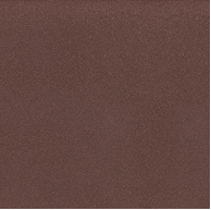
Rusty Angel - 09